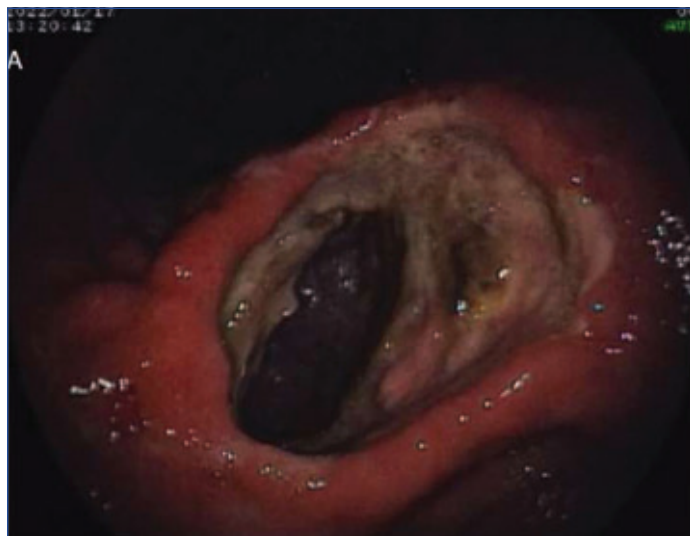
[Table/Fig-1]: Endoscopic image of a large Gastric Diverticulum (GD) with ulceration.

Upon examination, he was found to be hypotensive (blood pressure: 90/60 mmHg), tachycardiac (heart rate: 102/min), and tachypnoeic (respiration rate: 24/min); he also had pallor. Laboratory tests revealed normocytic normochromic anaemia (haemoglobin: 8.2 gm%). Stool for occult blood was positive. During endoscopy, a large opening was observed arising from the posterior wall of the stomach body, showing an ulcerated surface with visible blood vessels, suggestive of Gastric Diverticulum (GD) with ulceration [Table/Fig-1].