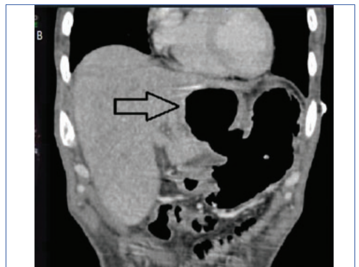
[Table/Fig-2]: Contrast Enhanced Computed Tomography(CECT) abdomen showing a Gastric Diverticulum (GD) (approximately, 6.6×4.8 cm) along lesser curvature of body of stomach.

An endoscopy-guided biopsy was taken from the diseased area. The biopsy specimens were stained with Haematoxylin and Eosin stain (A-low power view: 10x [Table/fig: 3(a)] and B-high-power view: 40x [Table/fig: 3(b)]) and showed mucosal atrophy with mild dysplastic changes. The underlying submucosal tissue showed an abundant chronic inflammatory infiltrate composed predominantly